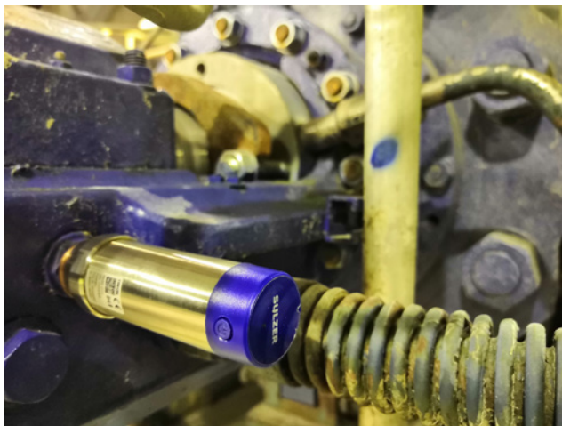
Fig 1. Sulzer Sense installation at a customer site.

As digital sensors are becoming cheaper and more equipment is connected to the Internet (Internet of Things, IoT), there is an enormous potential to convert data from the devices into actionable business insights. This can be translated into optimized predictive maintenance and maximized uptime of the process in question.