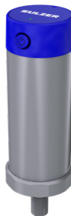
Fig 4. Sulzer Sense wireless IoT condition monitoring sensor.